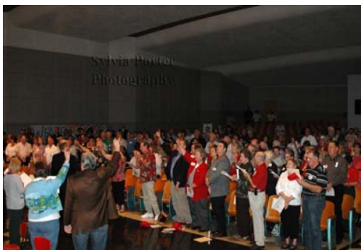
Waltrip Alumni Association, Inc. formation October 15, 2010